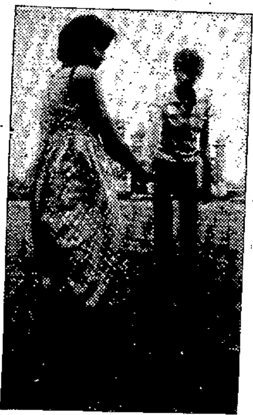
Student rarely get facilities for sports.

According to some educationists the teachers community