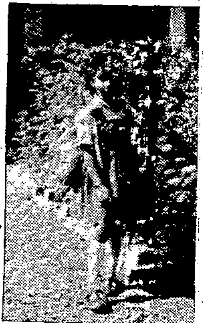
Education of these children suffer at primary schools.

Some educationists suggest that the local authority and the higher authority concerned should make arrangements for paying vigilant or surprise visit to the edu-