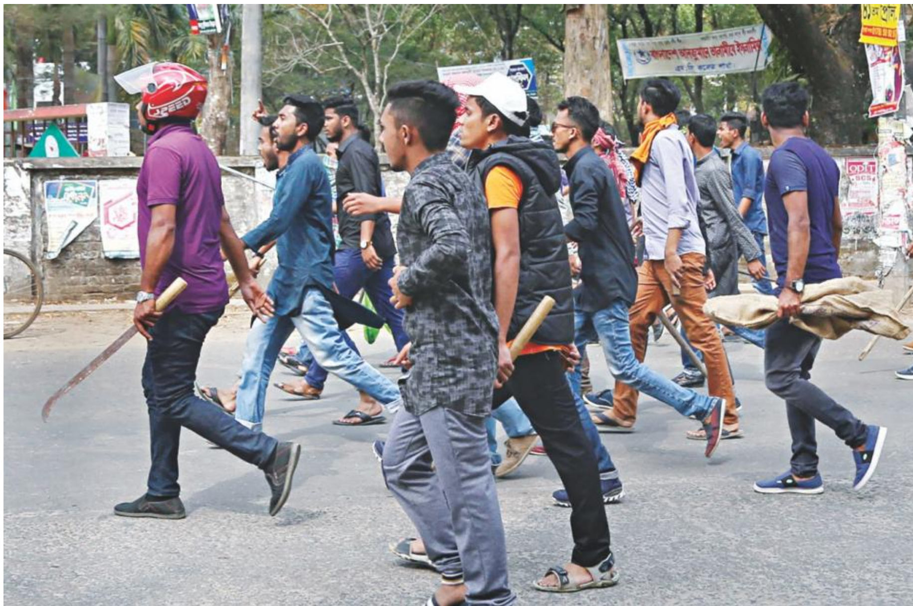
Holding sticks and sharp weapons, a group of alleged Bangladesh Chhatra League activists walks in front of MC College in Sylhet during a clash between two factions of the pro-Awami League student body yesterday afternoon.

There has been growing tension between the groups since January. Following multiple clashes, the JnU BCL committee was temporarily suspended on February 3 by central leaders.