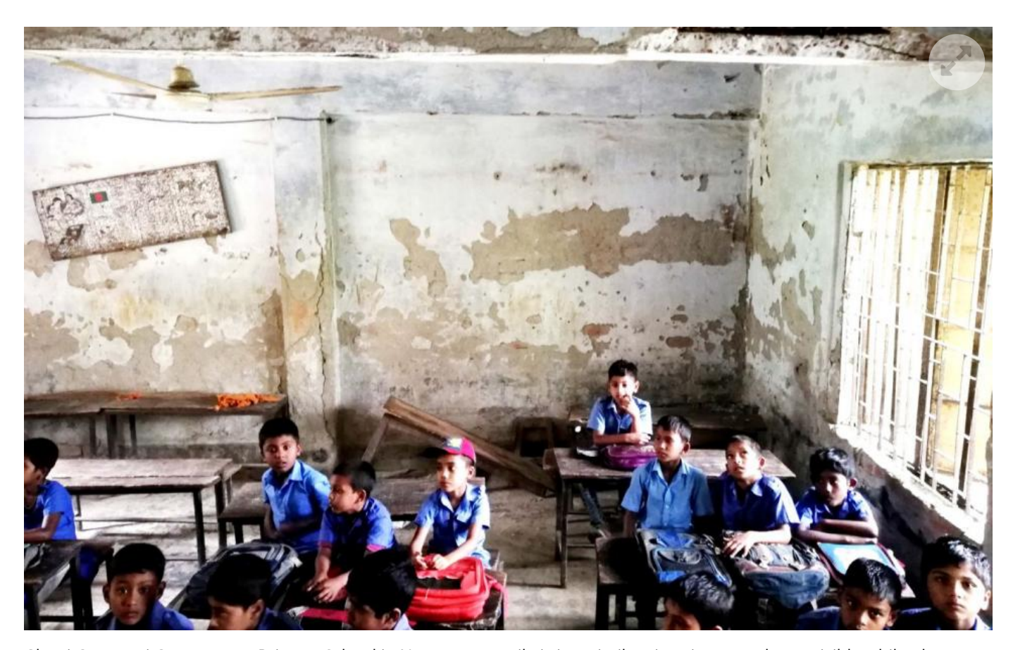
Ghuni Gazamati Government Primary School in Nagarpur upazila is in a similar situation as rods are visible while plasters have fallen off most of the places.

UNO Aminur Rahman declared the building abandoned immediately to protect the students from any untoward incident, but the danger still prevails as the classes are now being held at a nearby rented tin-shed structure.