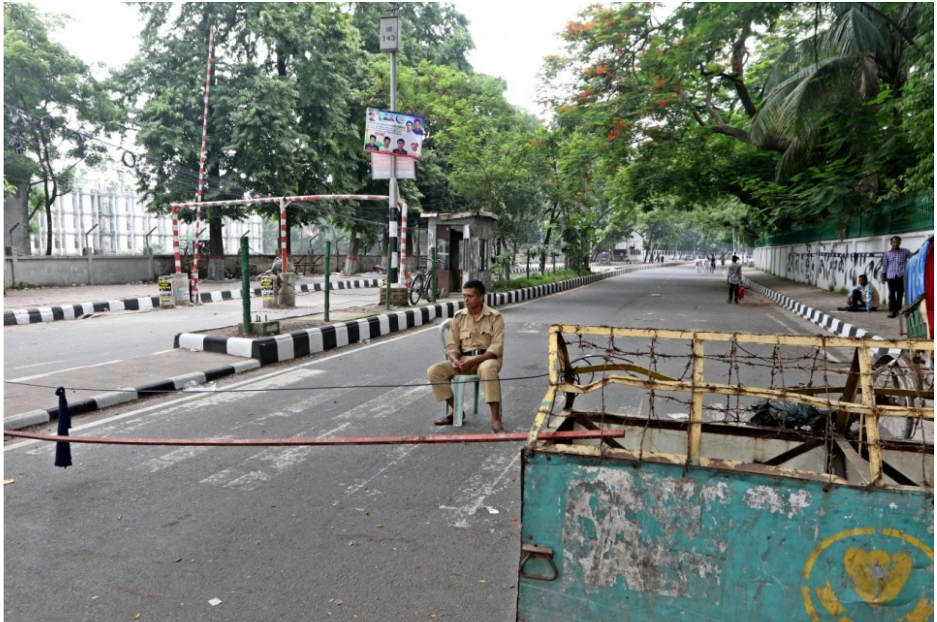
Roads entering the university were blocked during the demonstration.

Meanwhile, Buet students yesterday continued their protest for the fifth consecutive day, to press home their 16-point demand including cancellation of the recruitment order of director of students' welfare.