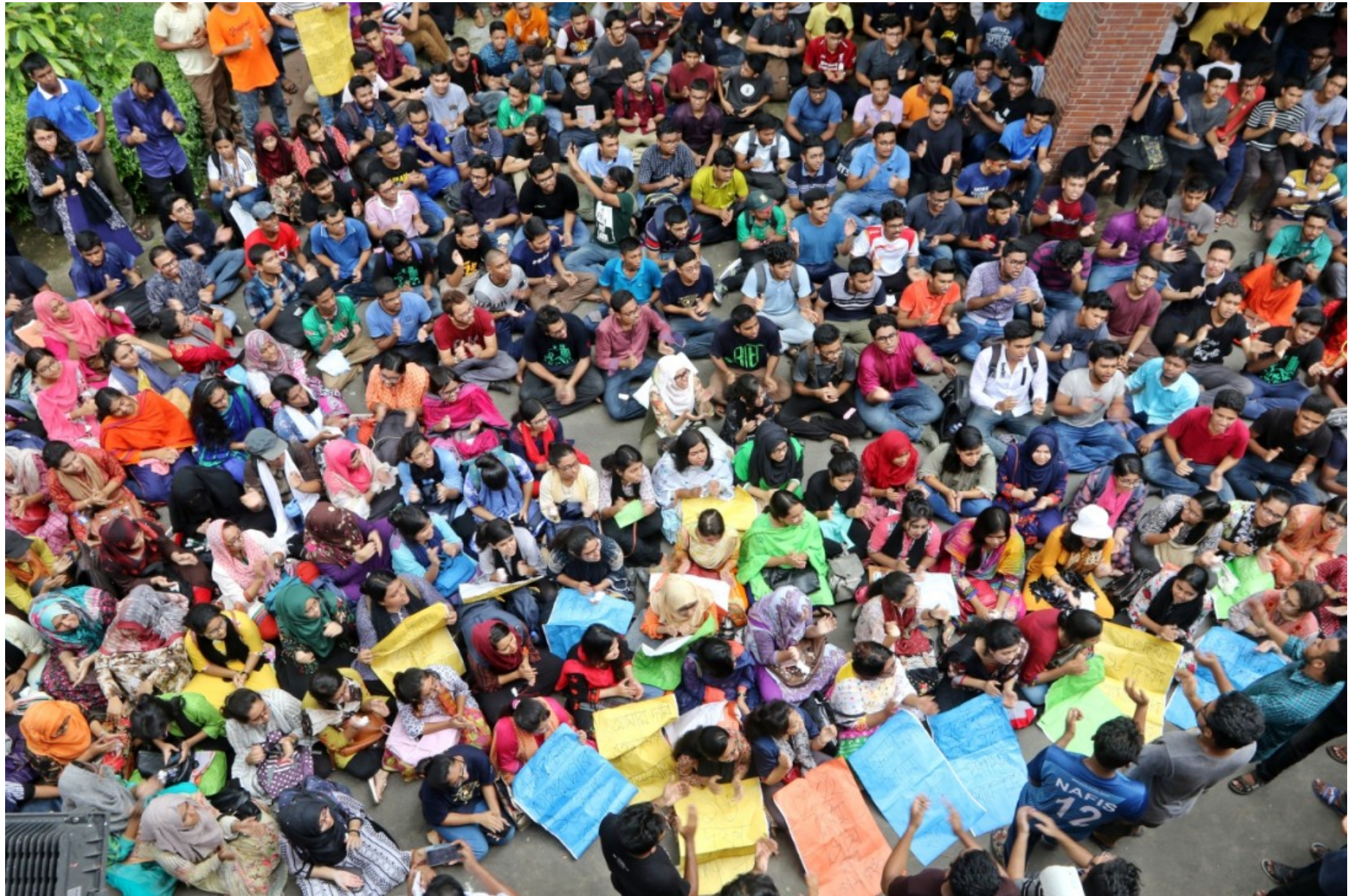
Buet students continue their protest for the fifth consecutive day, to press home their 16-point demand.