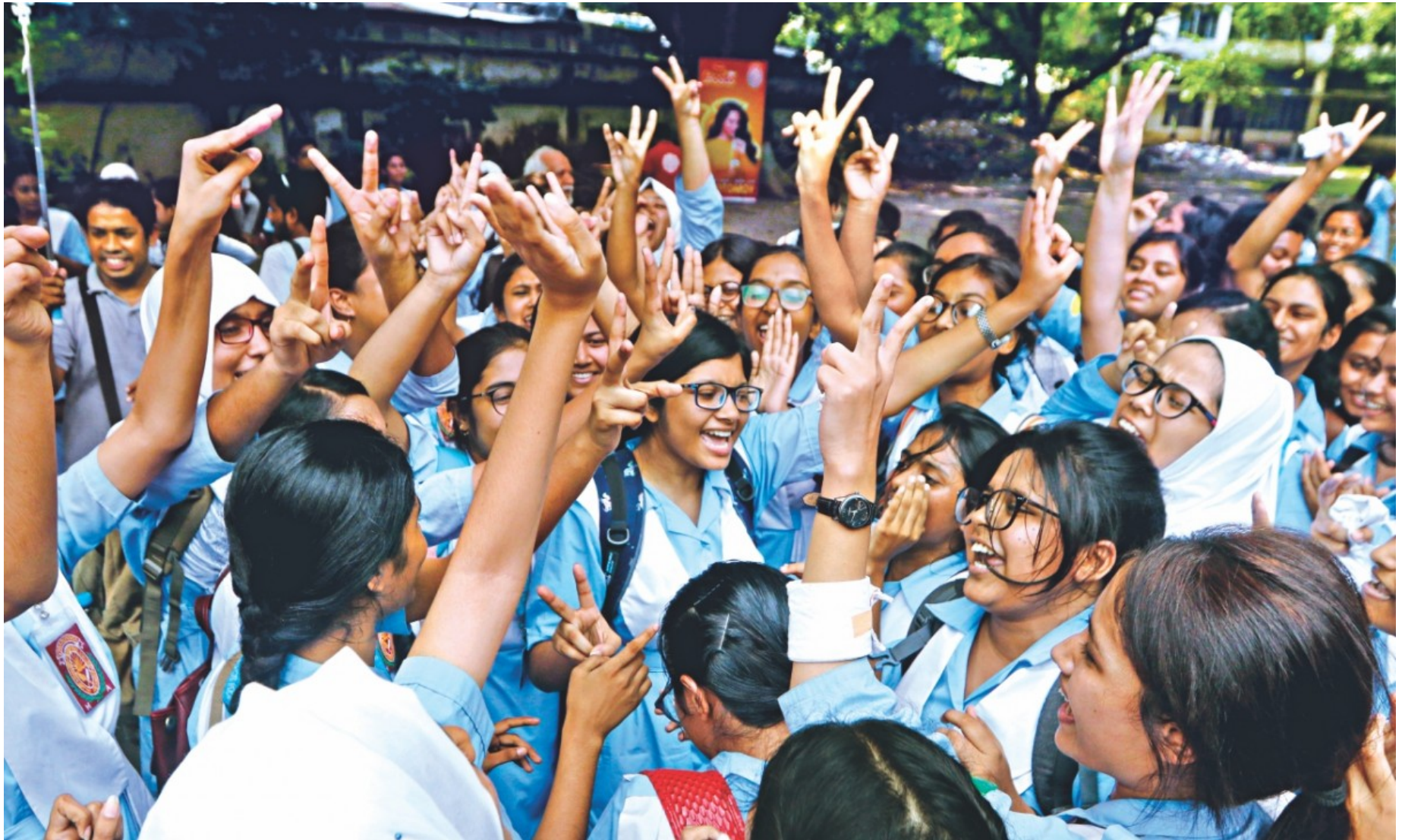
Students of Viqarunnisa Noon School & College celebrate on their Siddheswari campus yesterday after HSC results were out. Many of them achieved GPA 5.