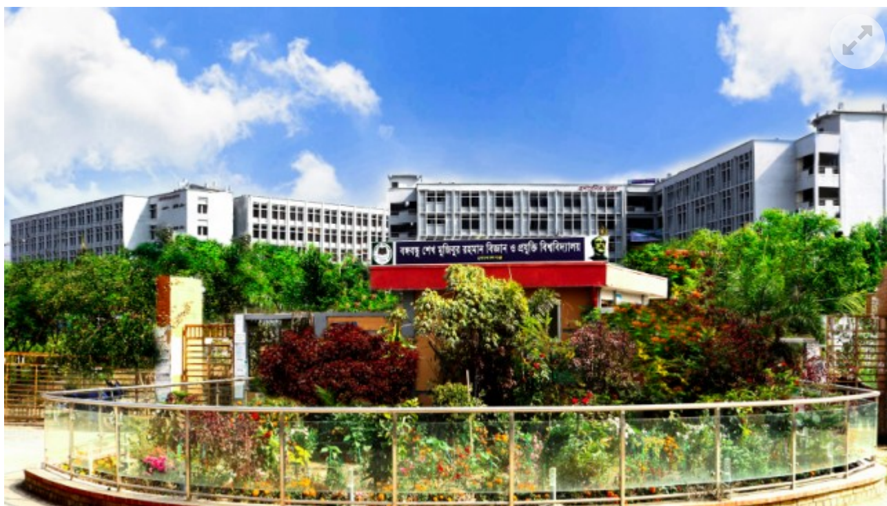
Bangabandhu Sheikh Mujibur Rahman Science and Technology University (BSMRSTU).