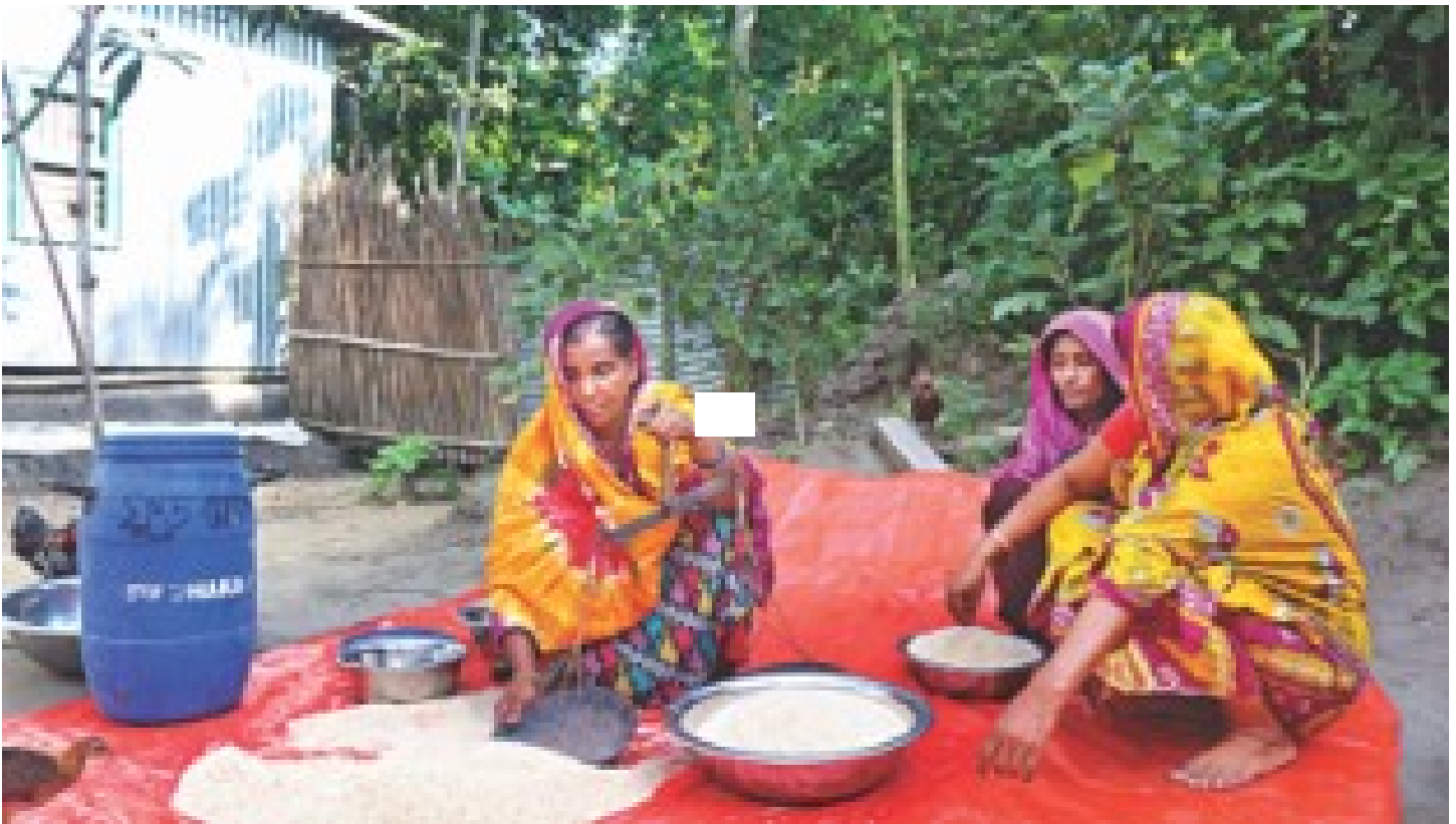
A food bank for rainy day