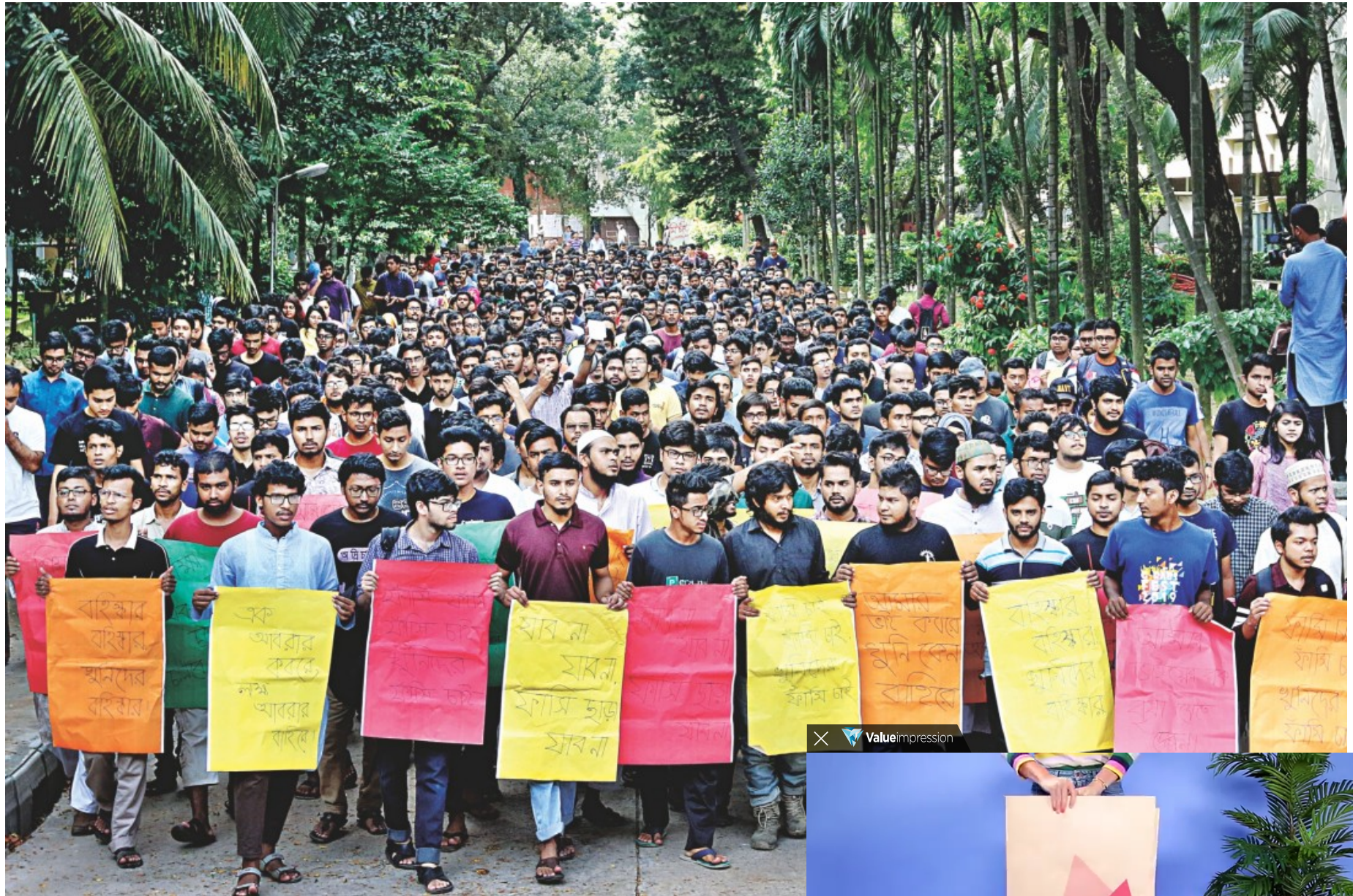
Buet students bring out a procession on the campus yesterday, demanding justice for fellow student