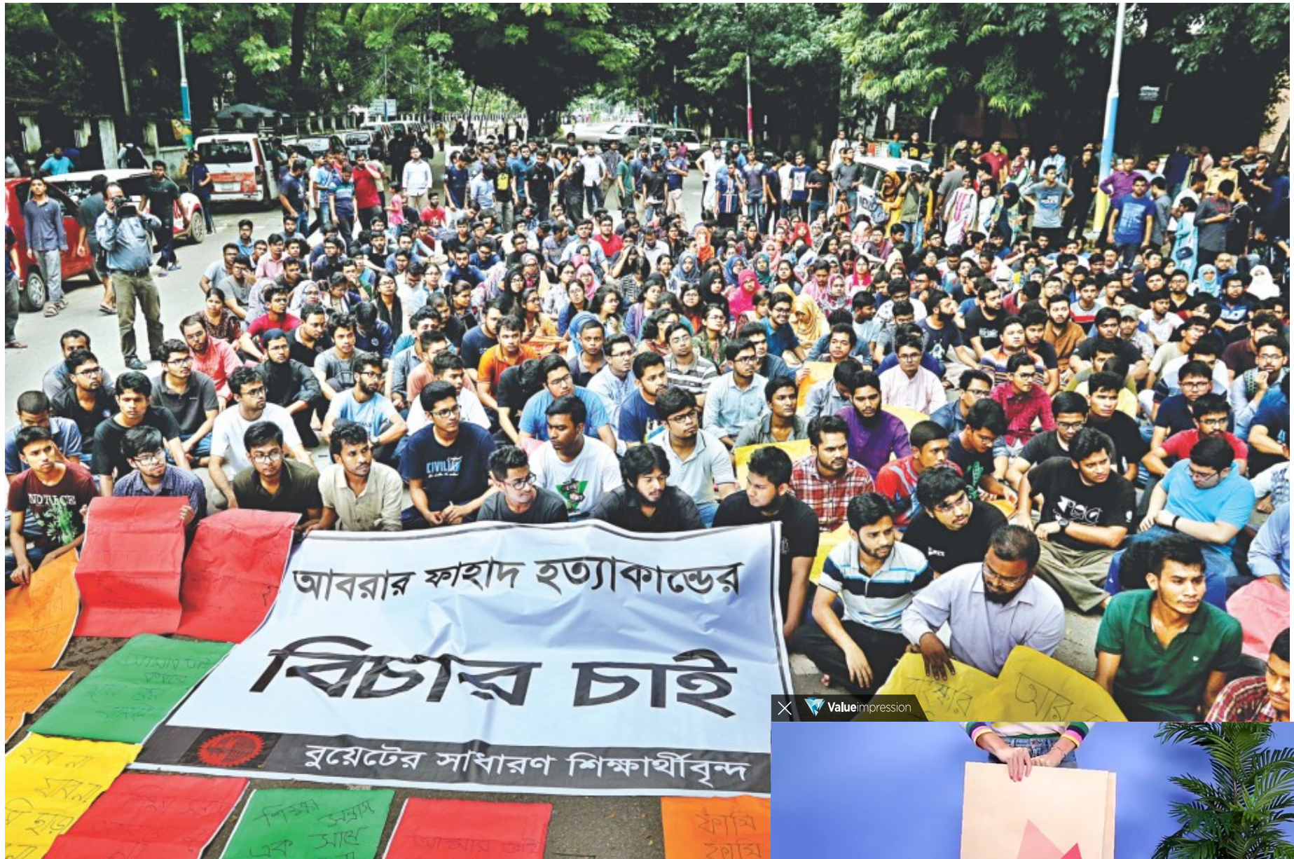
Protesters stage a sit-in near the main entrance to the university.