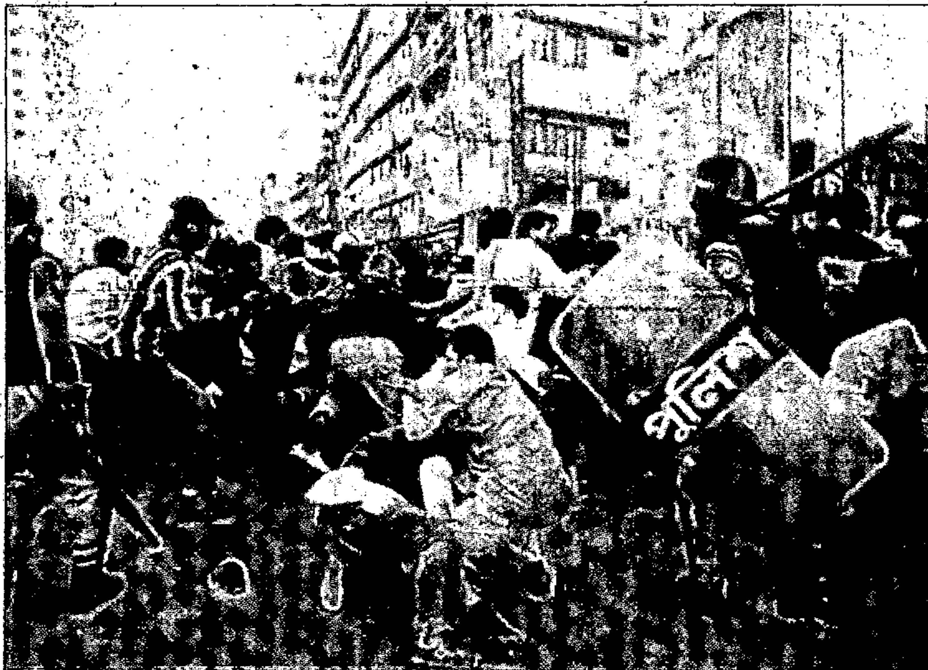
Police club JCD men in a procession near Naya Paltan yesterday.

The protestors exploded a series of bombs and set fire to vehicles, including a state-run BRTC double-decker bus.