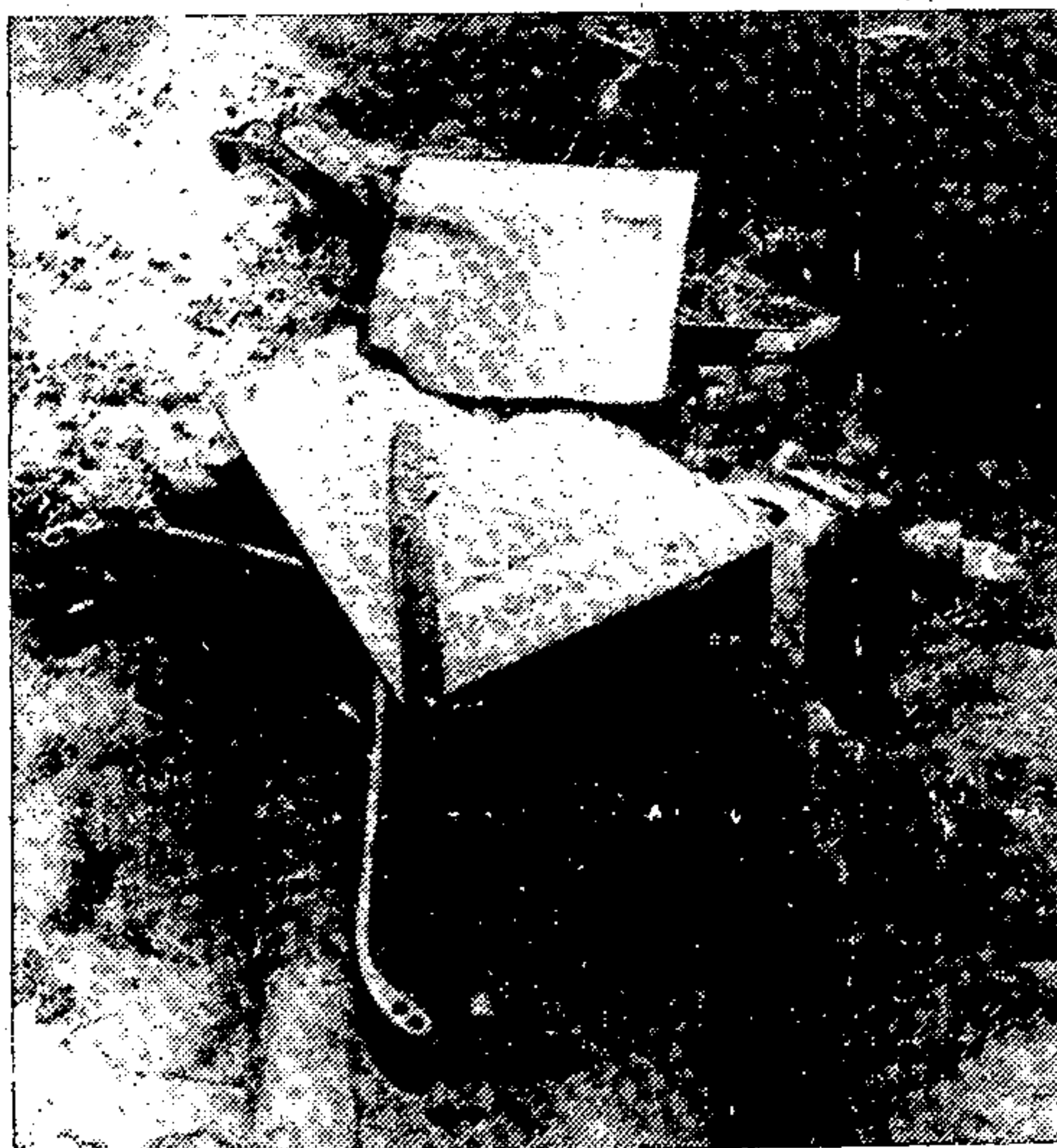
A view of the DUCSU office after it was ransacked by a group of angry students on Thursday.