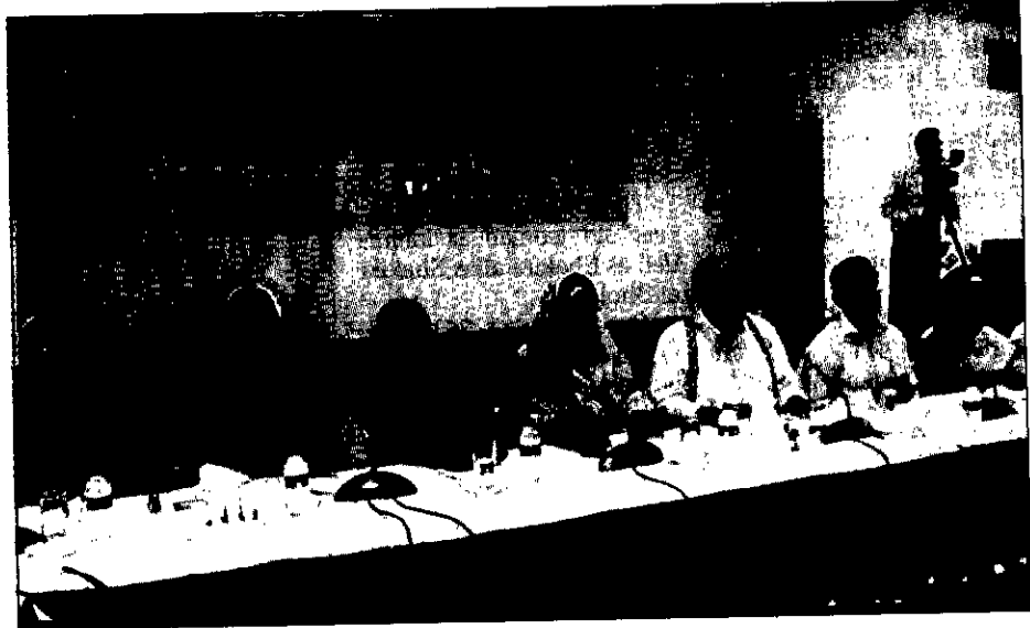
Nagarik Platform, Bangladesh and Bangladesh Mahila Parishad jointly organise a dialogue on global development agenda and woman's rights at CIRDAP auditorium in Dhaka on Tuesday.