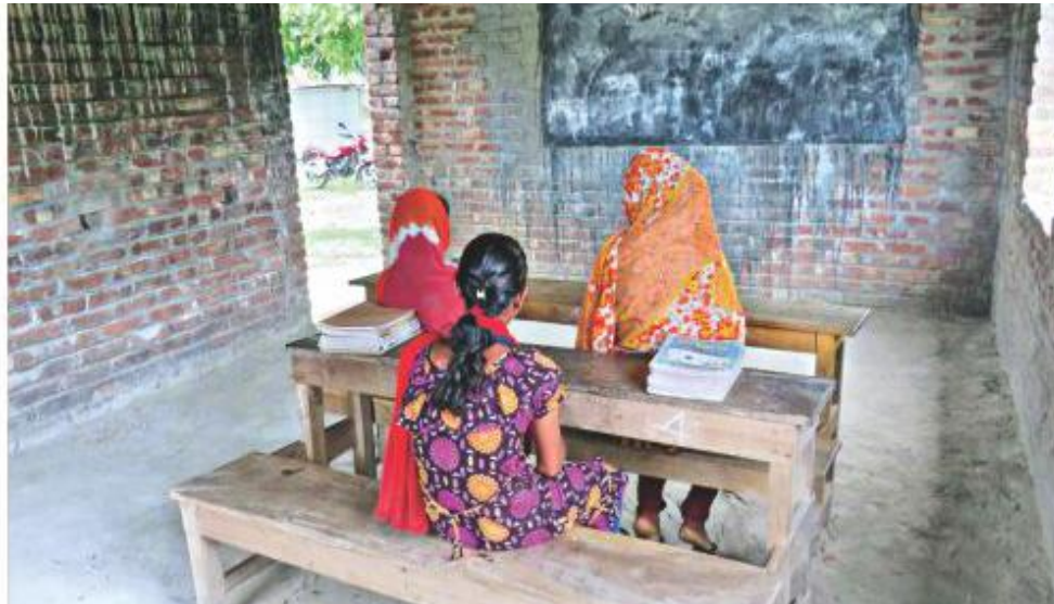
Three out of the four sixth graders are present in class at Nalbari Girls School in Dinajpur's Khansama upazila on Monday, but there is no teacher.

We are worried to learn that 109 educational institutions in the country have had zero pass rates in this year's SSC exams. The students of these schools have failed despite the fact that the teacher-student ratio of these schools is above the national average of one teacher for 42 students and international average of one for 30 students. If so, then why such a debacle in the results?